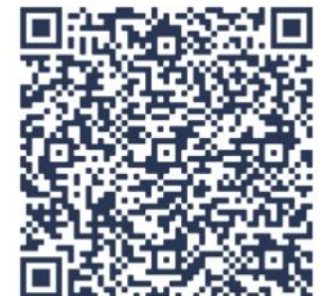
Find the location on Google Maps.